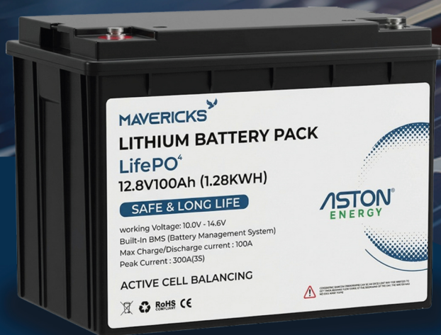
MAVERICKS 12.8v100Ah (1.28 KWH)